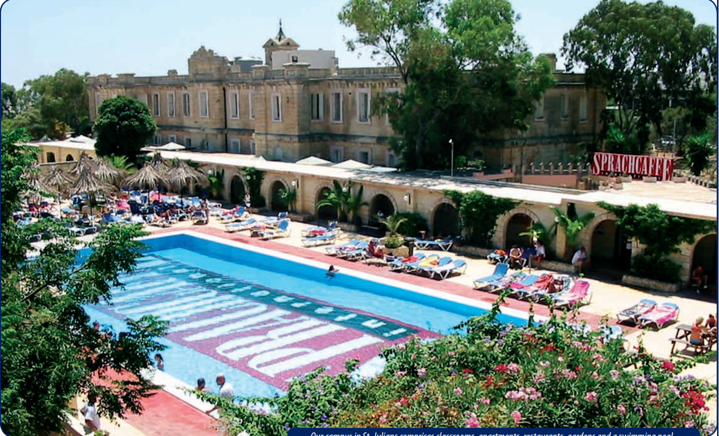
Our campus in St. Julians comprises classrooms, apartments, restaurants, gardens and a swimming pool.