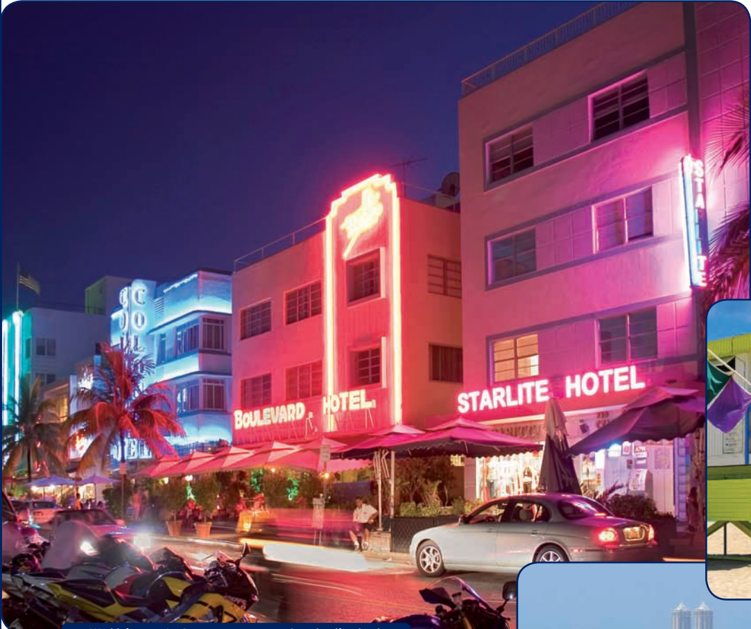
World-famous Art Deco area next to our Sprachcaffe school.