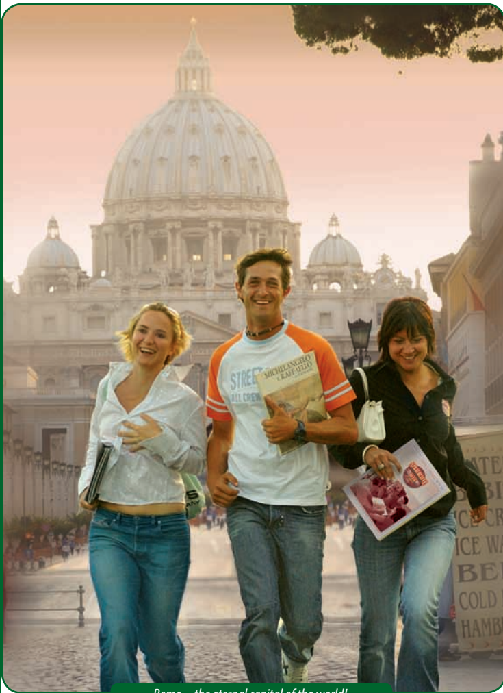
Rome – the eternal capital of the world!

Today's Rome is a contemporary metropolis of world fame which still reflects the various epochs of its long and colourful history in its architecture, culture and people.