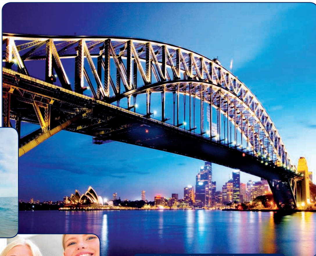
Sydney Opera and Harbour Bridge – what a great city!