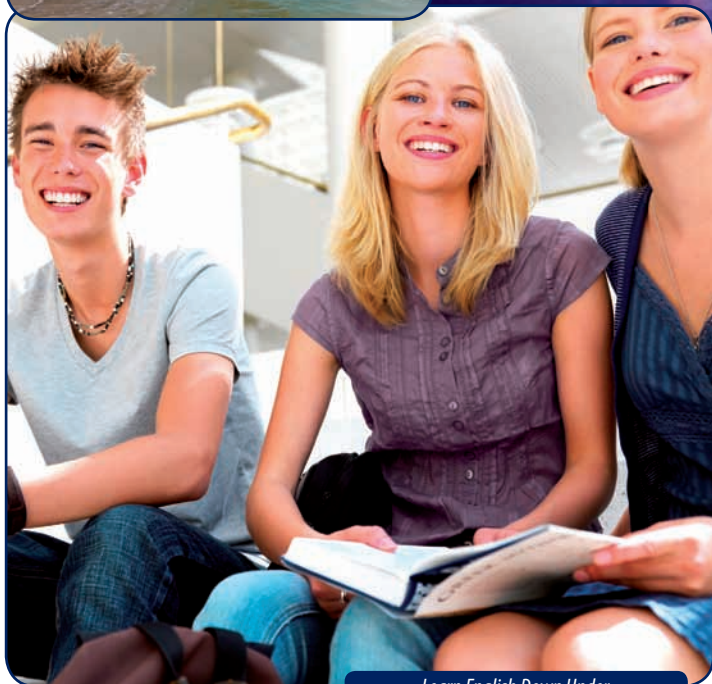
Learn English Down Under