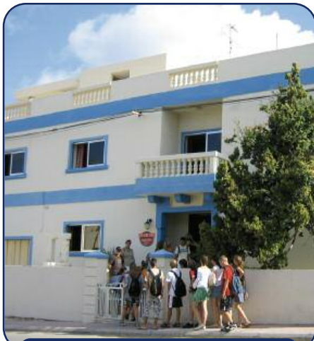
Our school building in St. Paul's Bay located ...