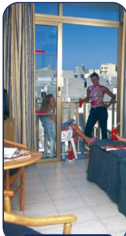
... near the beach.