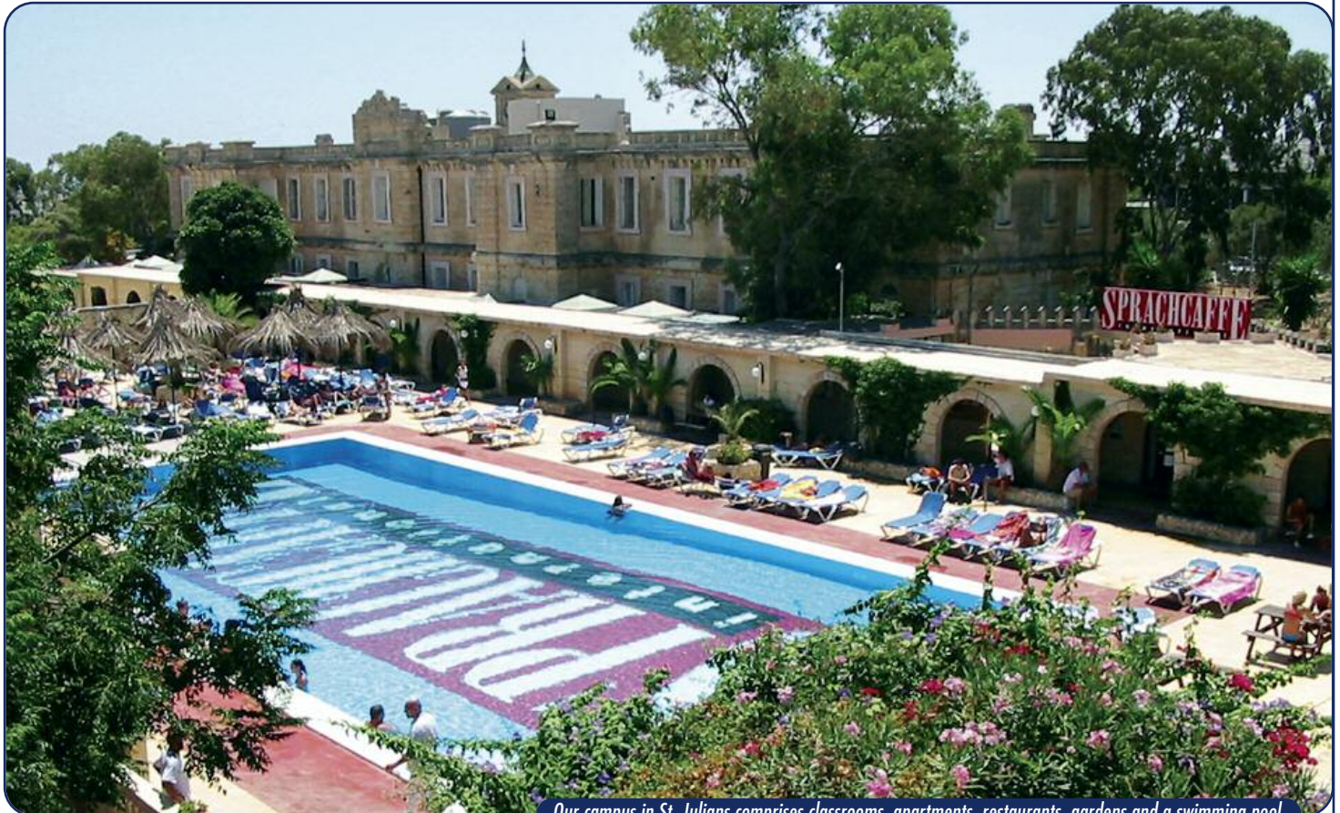
Our campus in St. Julians comprises classrooms, apartments, restaurants, gardens and a swimming pool.