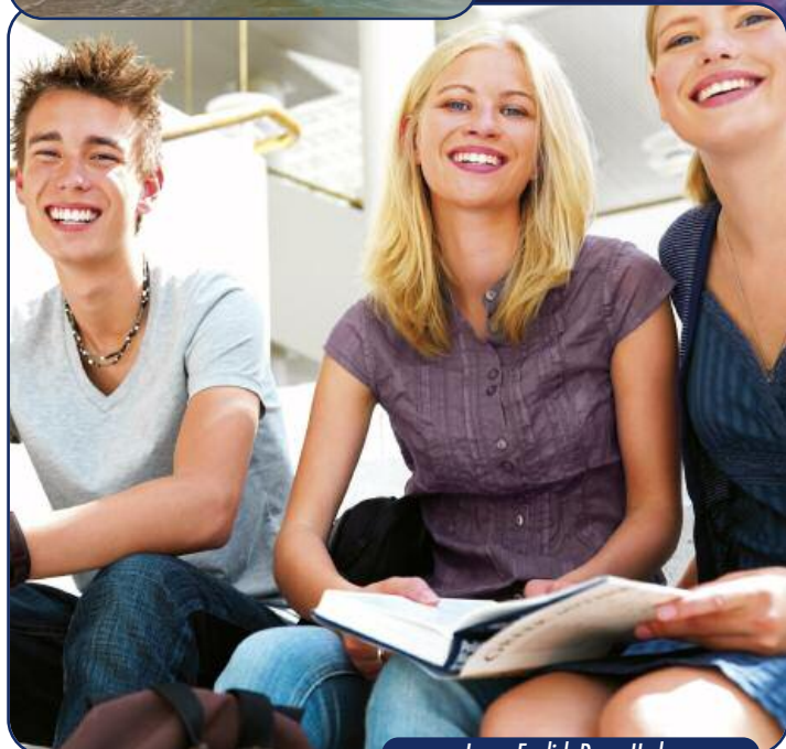
Learn English Down Under

Sydney is a vibrant and dynamic city waiting to be explored.