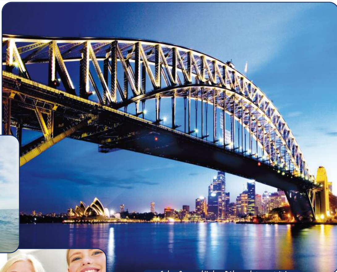
Sydney Opera and Harbour Bridge – what a great city!